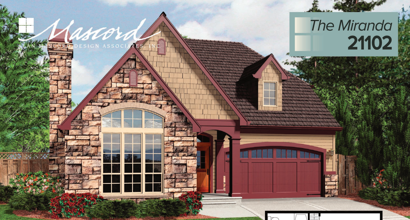
©Alan Mascord Design Associates, Inc.